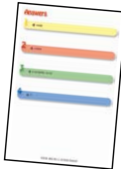
Answer Card (Back Side)